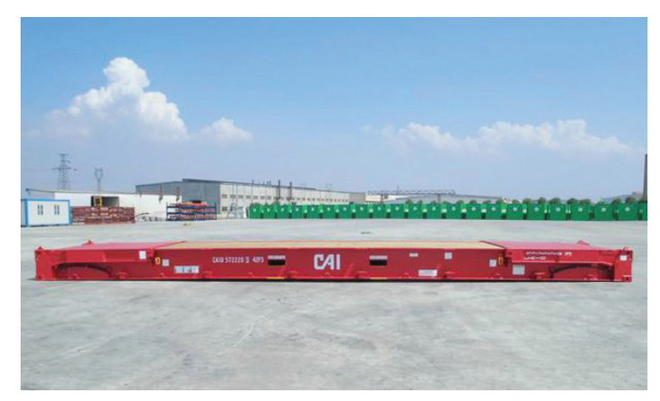
40' Flat Rack Containers (End frame folded)