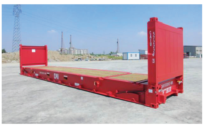
40' Flat Rack Containers - (End frame erected)